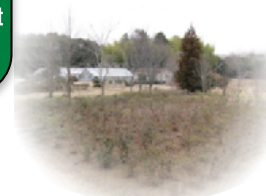
Tsukuba Experimental Forest Station