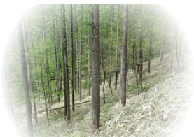
Yatsugatake Forest Station