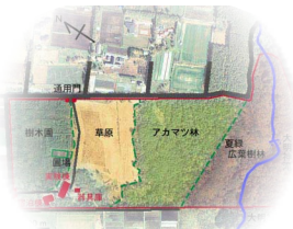
Sugadaira Research Station