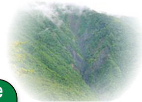
Ikawa Forest Station